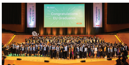
Commencement Ceremony Barcelona