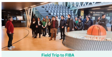
Field Trip to FIBA