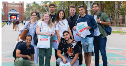
EU City Challenge