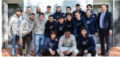
Sports on All Our Campuses