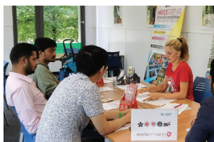
Mini Job Fair