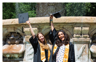
Commencement Ceremony Munich