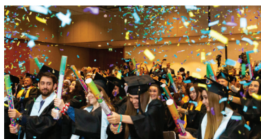
Commencement Ceremony Geneva